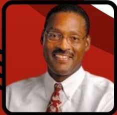
Junior Bridgeman Successful Businessman, Entrepreneur