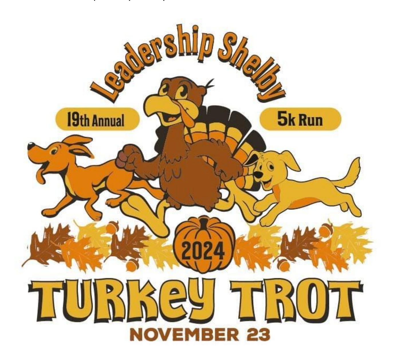
Nov 23<sup>rd</sup> – Leadership Shelby Turkey Trot

Nov 26<sup>th</sup> - Kiwanis 70<sup>th</sup> Farm City Banquet